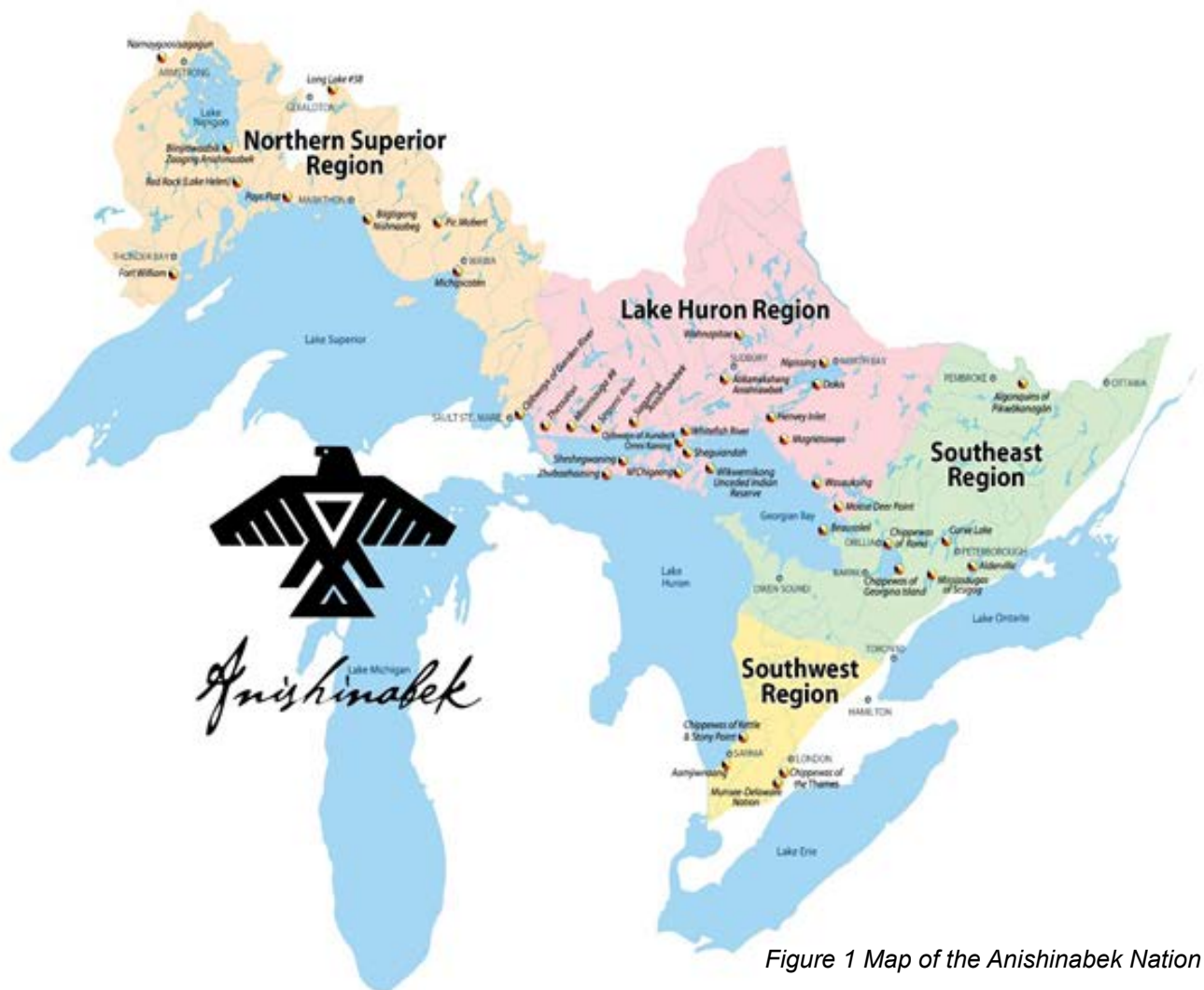
Figure 1 Map of the Anishinabek Nation

The Mining and Northern Development Lake Huron Regional Round Table took place on Wednesday February 22, 2017 at the Elders Hall at the Anishinabek Nation Union of Ontario Indians Head Office on the traditional territory of Nipissing First Nation. This was the first Regional Table meeting of its kind in the region as a result of the implementation of a new regional engagement framework put in place by the Union of Ontario Indians (UOI). This initial meeting was formulated as a meet and greet and was an opportunity for the participants to become further equated with the regional framework. Figure 1 below denotes the Lake Huron Region of the Anishinabek Nation (AN).