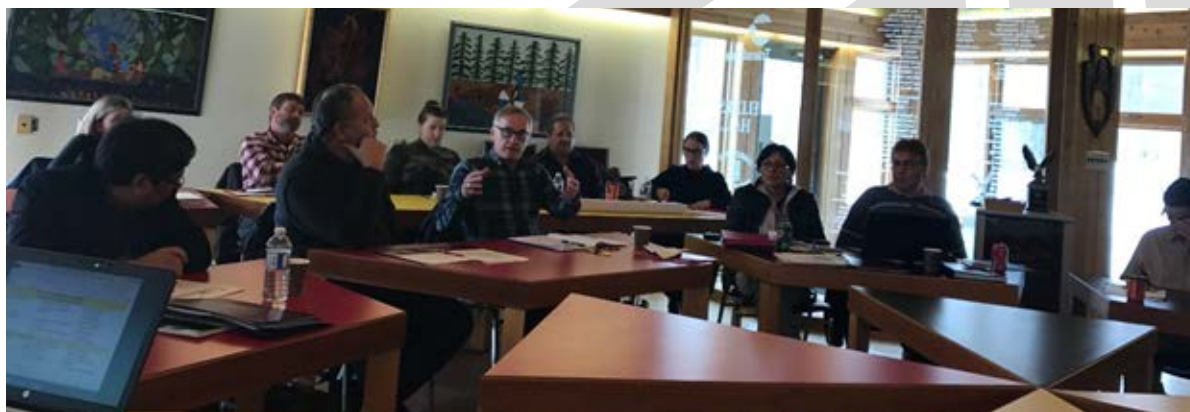
Figure 3 Lake Huron Regional Table Discussion of Values Mapping

The letter of intent that established the AN-MNMD Bi-Lateral Leadership Forum was presented and discussed. As was the evolving Terms of Reference (TOR), for the Regional Tables. Table participants agreed to use this document as a starting point for discussion of a TOR for the Regional Table moving forward. Table participants took particular note of the inclusion of the recognition and respect for the Ngo Dwe Waangizid Anishinaabe “One Anishinaabe Family” alongside recognition and respect for the aims of the Mining Act. The UOI facilitator stressed the utility of the Regional Table process and suggested that regional priorities for action related to mining and development should be discussed at the next meeting of the Table. A number of Table participants expressed the need of the Regional Tables, increased dialogue with MNM and between communities of the region. The floor was then opened up for discussion the Table explored what they would like to see the Regional Table accomplish.